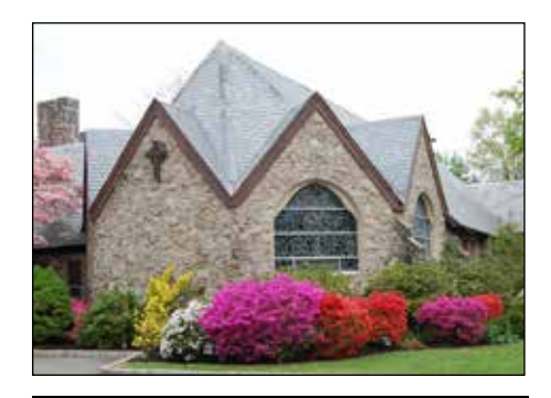
Give God what is right, not what is left

If you have an item you would like to sell or donate, you can post it on the bulletin board on the wall outside of the kitchen door entering the Guild Hall. It's like a Craig's List for Christ Church! Remember, one man's trash is another man's treasure!