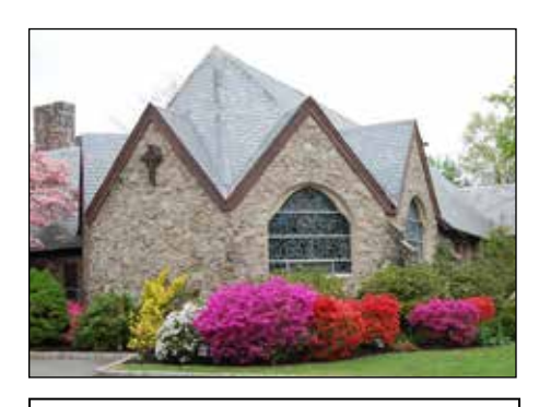
Give God what is right, not what is left

If you have an item you would like to sell or donate, you can post it on the bulletin board on the wall outside of the kitchen door entering the Guild Hall. It's like a Craig's List for Christ Church! Remember, one man's trash is another man's treasure!