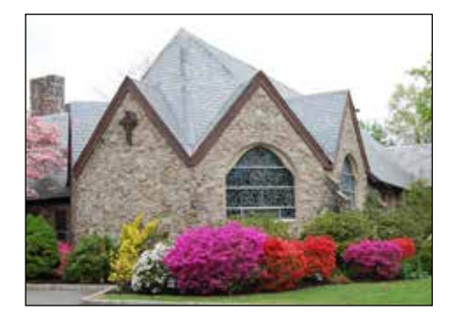
Give God what is right, not what is left

If you have an item you would like to sell or donate, you can post it on the bulletin board on the wall outside of the kitchen door entering the Guild Hall. It's like a Craig's List for Christ Church! Remember, one man's trash is another man's treasure!