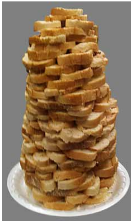
Pictured above is the Beefsteak Dinner bread tower from the winning table.

Capital Campaign Offering envelopes are available for your convenience, and can be found on the table in the Vestry Room or in the Parish Office.